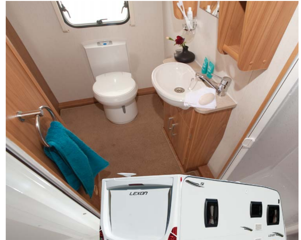
Chrome Shower Fittings C250 CWE Swivel Toilet Spacious Washroom Storage