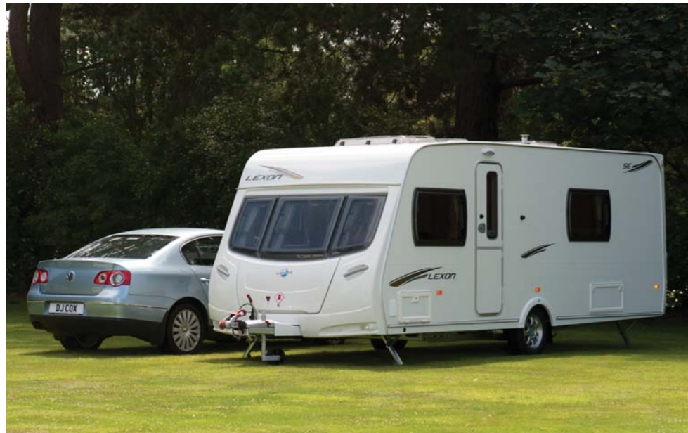
Lexon SE NEW - Exterior Graphics

Once again the weights of these ranges are the lowest in their class of caravan!