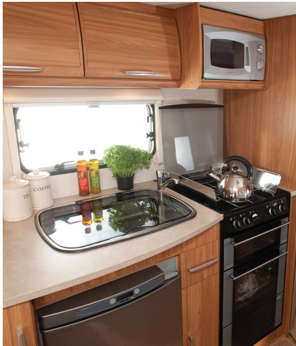
NEW – Thetford I12L Electronic Fridge New Style Oven/Grill Microwave