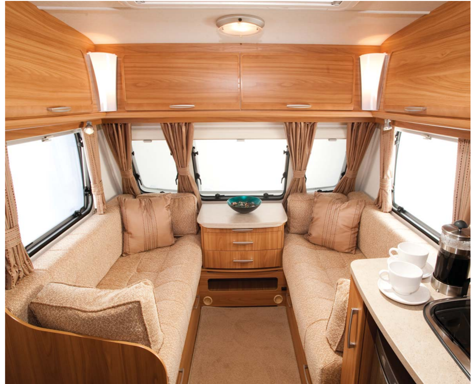
NEW - 'Fausto' Soft Furnishings Scheme NEW - 'Chestnut' Wood NEW - 'Crystal' Work Surfaces