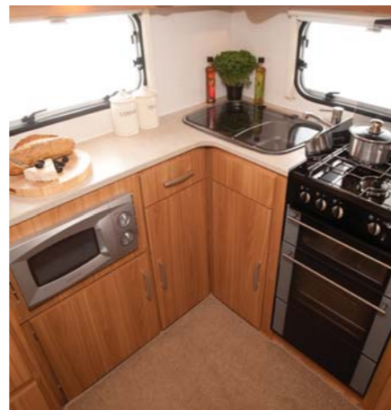
Stellar – Kitchen area with NEW - low level Microwave