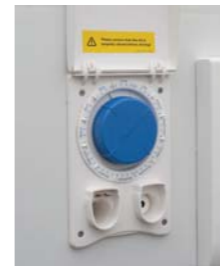
Midi Heki over Fixed Beds 7 Spoke Alloy Wheels External Shower/"Super Pitch" Connection Points