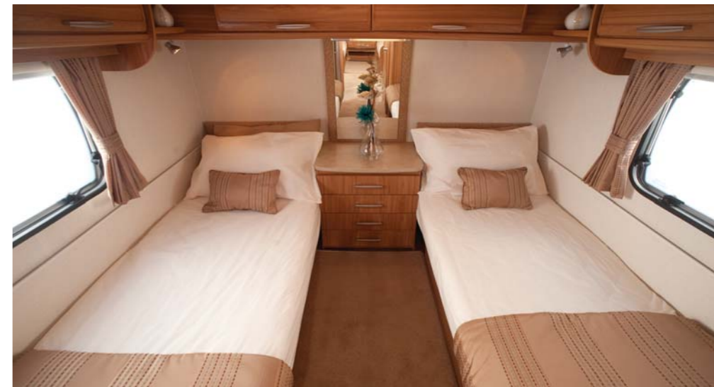
Lexon SB – Single Beds 'Argent' Sink/Drainer with Domestic Style Lever Action Tap