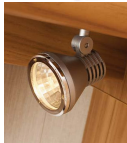
Stylish Light Fittings NEW - Lexon TL -Twin Lounge- 6 Berth Rear Seating/Bunks Area