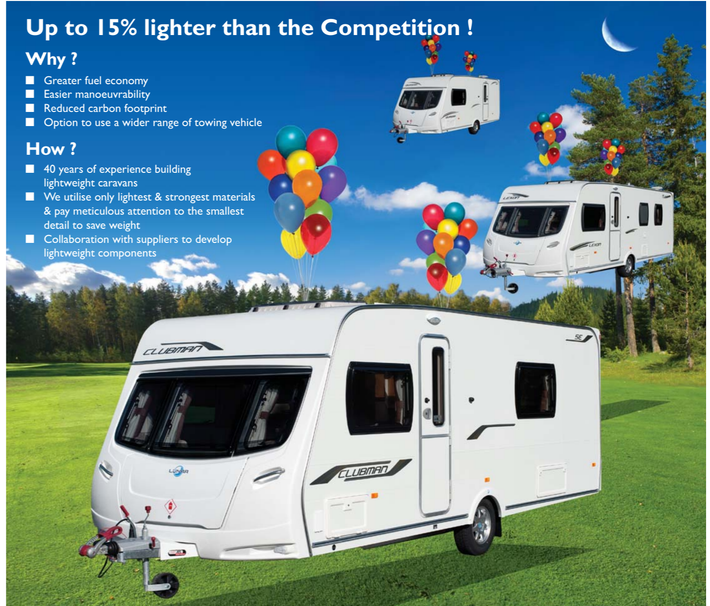
Ariva - Award winning lightweight luxury